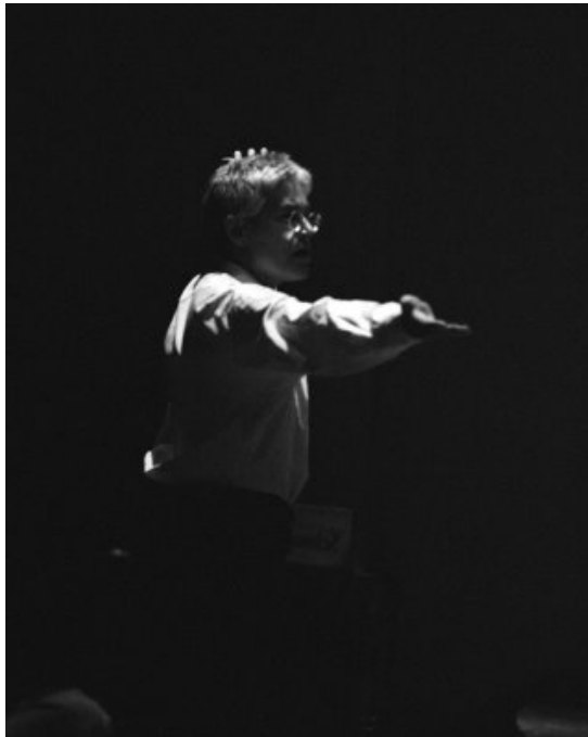
Alison Knowles conducting